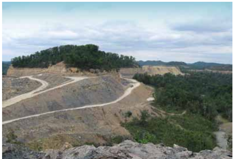
Overview of operation around unconstructed hollow fill.

Summit's mining engineers have prepared surface mine plans for over 40,000 acres of mining activity. These plans include mine design, excavation/fill details, and hollow fill plans, as well as sediment pond and access road design.